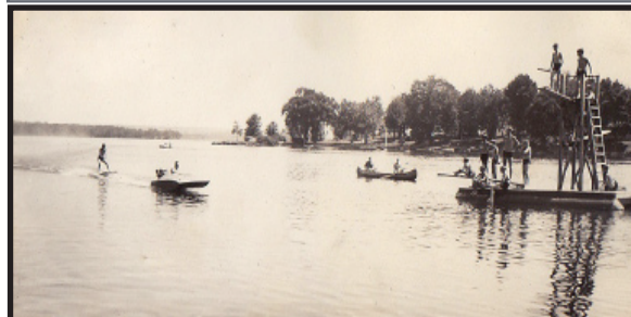
Camp Quarta - Lakeside. circa 1940's?