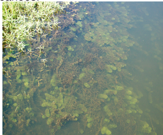
Fanwort lining the banks of the Bantam River

It is shocking to see how quickly the fanwort infestation has manifested. Now, more than three fourths of the Bantam River leading from Little Pond to the lake is choked with this menace and portions of the river are becoming nearly impassable for kayaks and canoes.