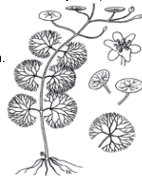
Cabomba caroliniana Fanwort